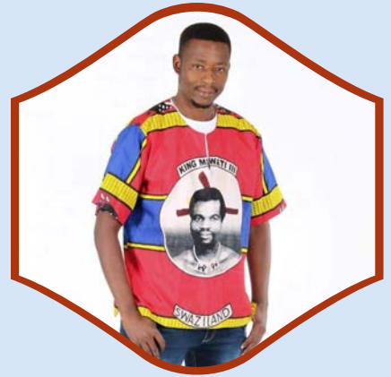
NEO MALEMA INITIATIVES ASSISTANT